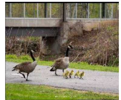
Goose family walks through UW.